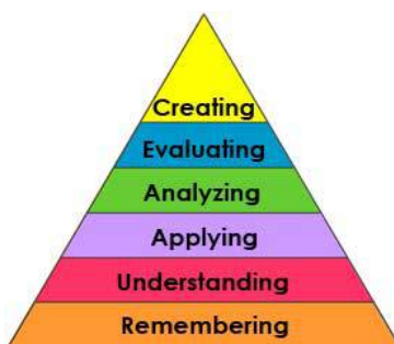
Blooms Taxonomy of Thinking and Learning (revised Anderson 2000)

See full Can-Do Benchmarks: http://www.actfl.org/sites/default/files/pdfs/Can-Do_Statements_2015.pdf