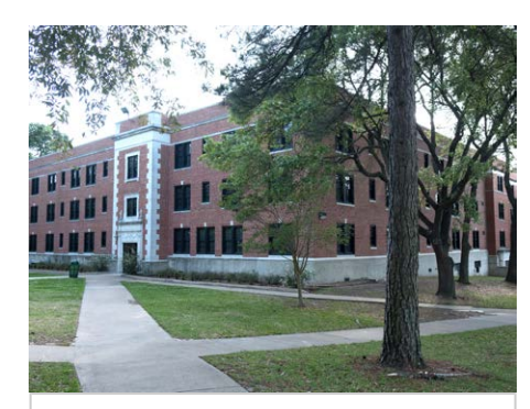
Residence Hall Tours